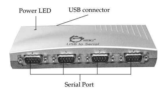
Figure 2. 4-port Layout